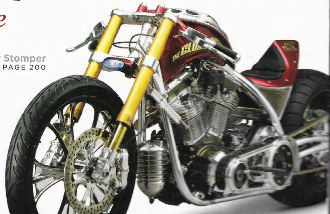
The Glory Stomper PAGE 200

FERRARI FORMULA ONE Racecar * Kilo of GOLDEN CAVIAR * 459-foot GIGAYACHT * NAPOLEÓN'S Love Letters * ASTOR'S Gilded Age Newport Estate * 300-Carat DIAMOND NECKLACE & More