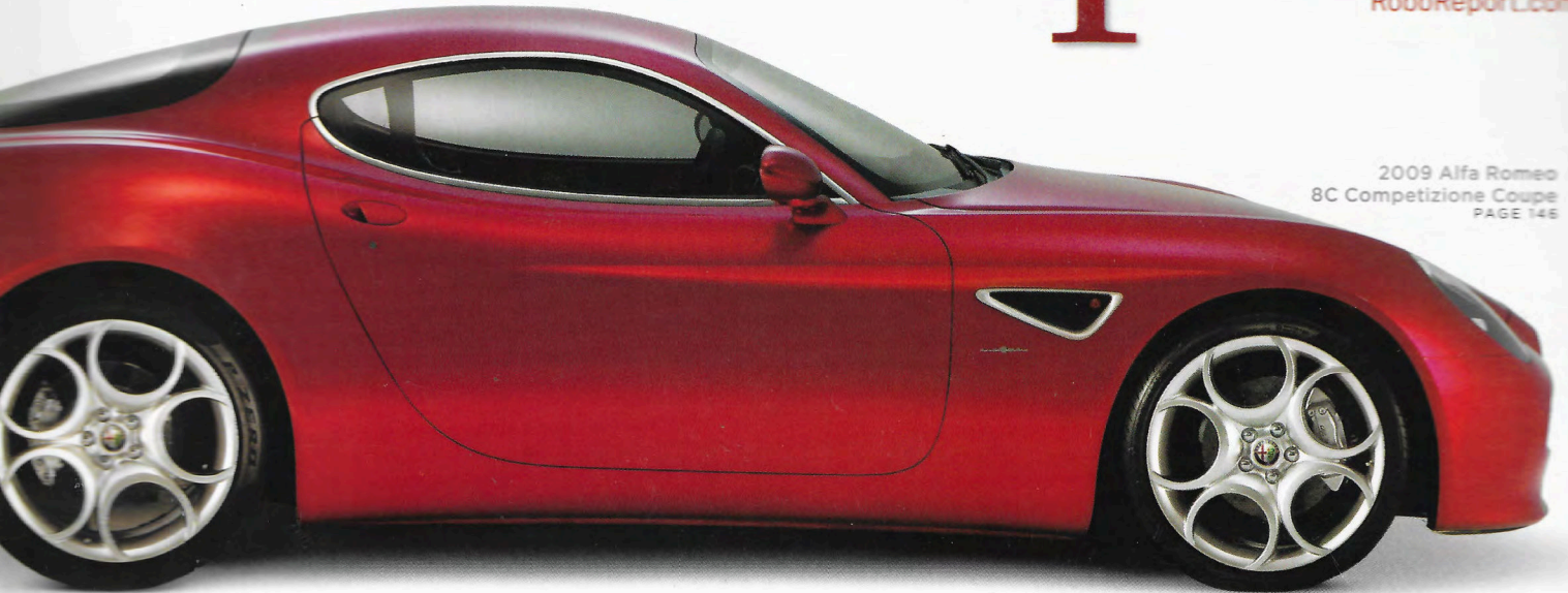
2009 Alfa Romeo 8C Competizione Coupe PAGE 146