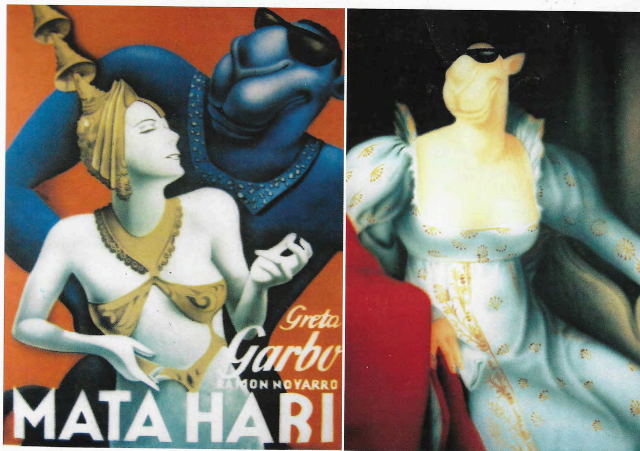
In his Joe Camel series of paintings, Zhou Tiehai mocks the commodification of art.

of his, commanded $3 million and became the top lot of the sale. The Chinese contemporary art market is booming, and Xiaogang and other artists who toiled in obscurity in the 1980s and 1990s are seeing their works sell for six- and seven-figure sums.